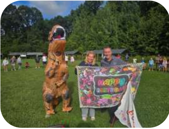
game during their field time

BIRTHDAY PACKAGE: If you would like us to celebrate your child's birthday at camp, you may purchase an optional Camp Boroughs Birthday Package for $60. Included in the birthday package: